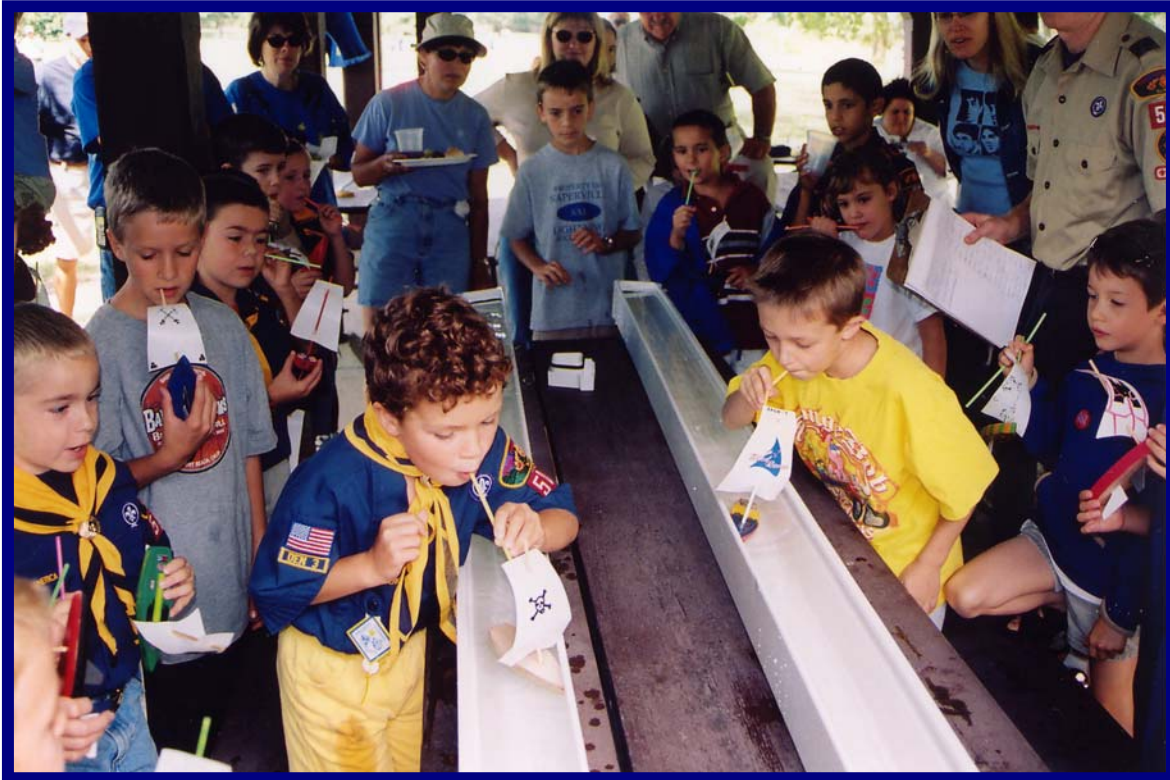
Tiger Cubs compete at the annual Rain Gutter Regatta, August 2004, while the others patiently wait their turns.